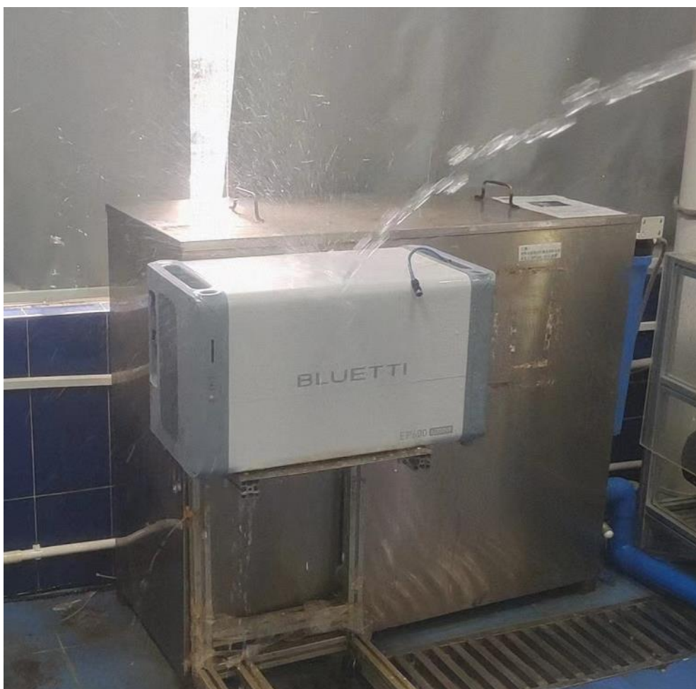
Test setup of IPX5