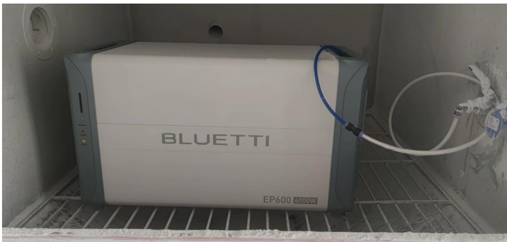
Test setup of IP6X